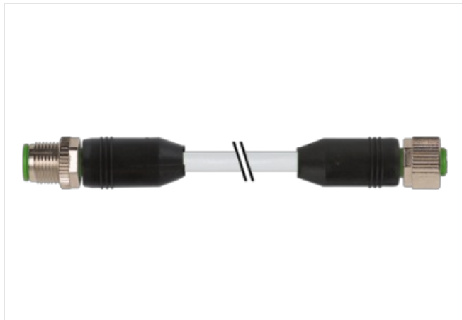
M12 male 0° / M12 female 0° A-cod.